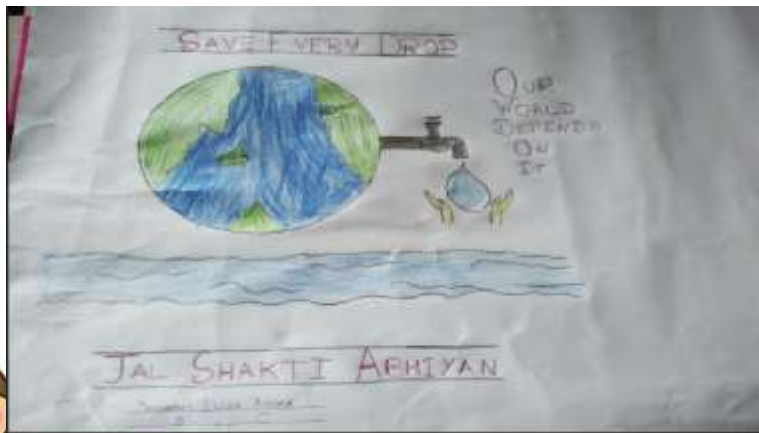
ELIZA – 3C