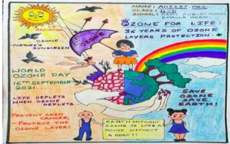
ANIKET PAI 4D