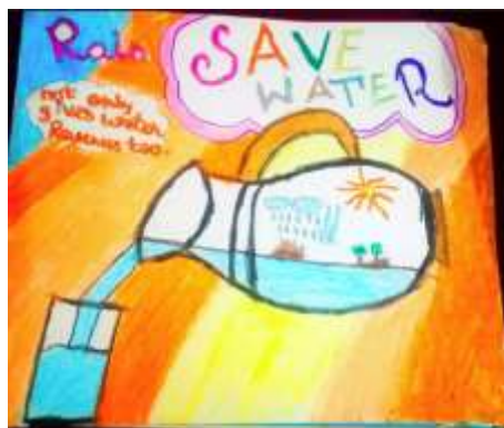
ANUBHUTI – 5E