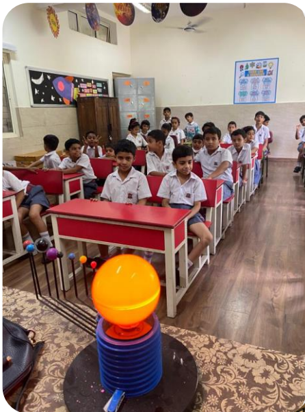
EVS LAB ACTIVITY

पाठ-7 "क्रिकेट का खेल" से संबंधित गतिविधि